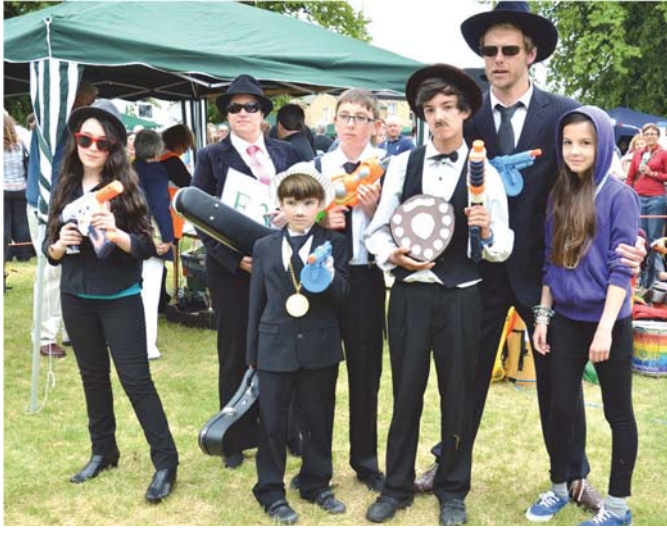
'Gangsters' from Pieces Terrace

On Saturday 8 th June the sun came out and drew the crowds to the Green for Waterbeach Feast. The parade of floats and walking groups left the school at 2pm led by the Arco Iris Samba Band. This year's theme was 'Something beginning with G....' and we saw ghosts, games, gardening, guards, gold, gnomes and gymkhana. The shield for the best decorated