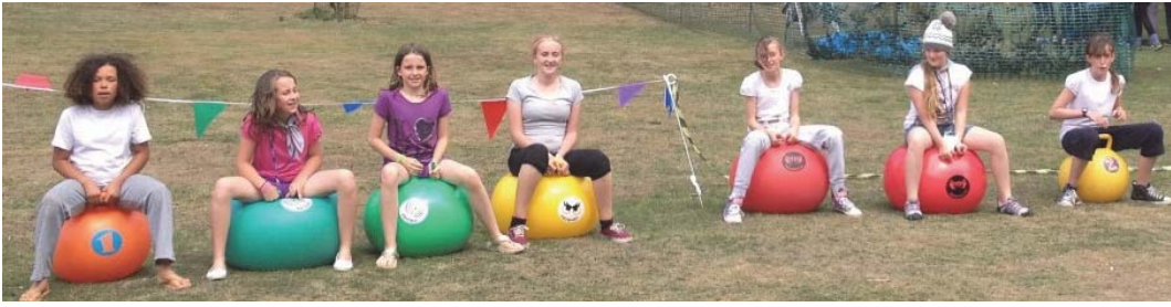
Waterbeach Guides enjoying the Air Zone at Anglia 13

around the region on an exhilarating week-long camp - Anglia 13 - at Hautbois, Girlguiding Anglia's residential centre in Norfolk. The girls took