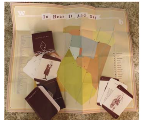
Waterbeach Game – ‘In Hear It And Say’

Part of the Public Art contribution from Morris Homes (who built Cam Locks), was used to create a number of small pieces of art work set at various locations round the village. They and other locations were used to create the ‘Waterbeach Game.’ However it is not necessary to take part in the Game in order visit and enjoy the locations. Each one has something about the history and legends of the village and the people who have lived in it. The very brevity of what they say in sign and word allows the observer's imagination free rein.