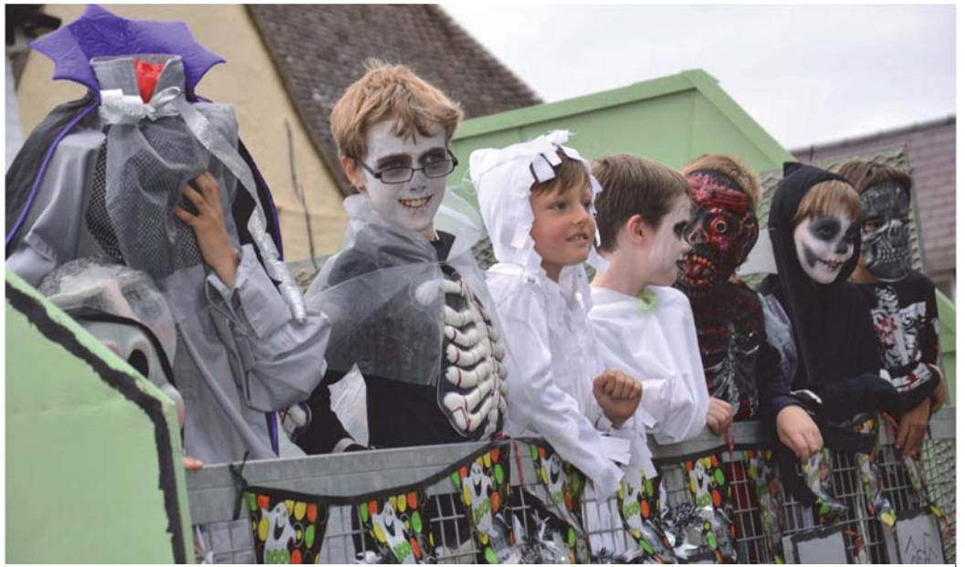
'Ghosts & Ghouls' – Waterbeach Cub Scouts

Thanks also to Cambridge City Moves for their support and