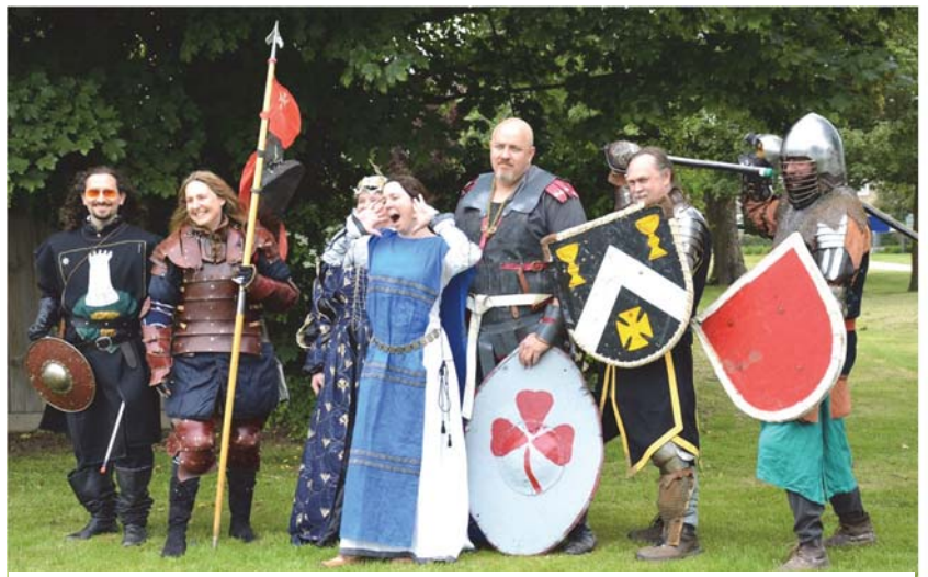
'Guards & Guilds' -Shire of Flintheath