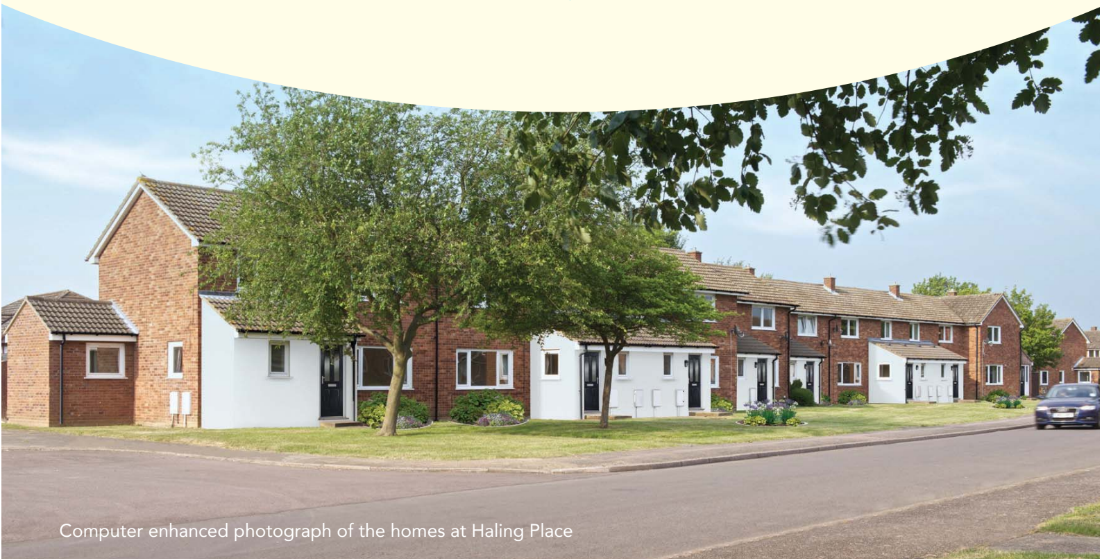
Computer enhanced photograph of the homes at Haling Place