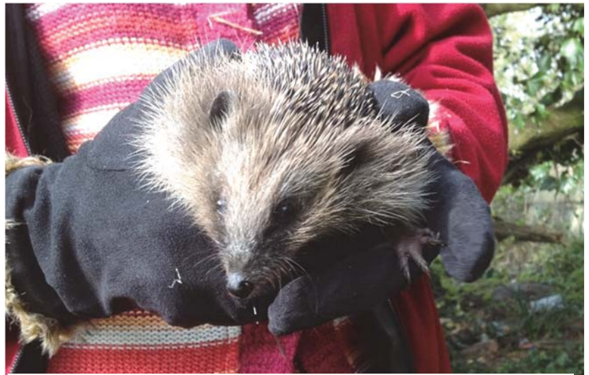
One of the hedgehogs released into the wild

In the spring I put an article in the Beach News asking for people with appropriate gardens and environment to offer to release a hedgehog. I was looking for big garden, not too neat and tidy and with access to other gardens. Preferably not too near a busy road, no badgers or a pond that an animal couldn't escape from. I asked the releasers to provide water and I gave them a two week supply of meal worms to help the transition to the wild.